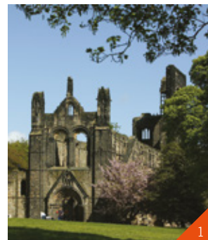
1 Bolton Abbey / 2 Yorkshire Dales / 3 Leeds city centre / 4 Trinity Leeds shopping centre / 5 Harewood House / 6 Leeds city centre at night / 7 Calls Landing and city cathedral / 8 City park / 9 Salts Mill

The Yorkshire Dales, Peak District and Lake District national parks are all within easy reach of Leeds, and historic locations like York, Harrogate, Haworth and Scarborough are just a day trip away.